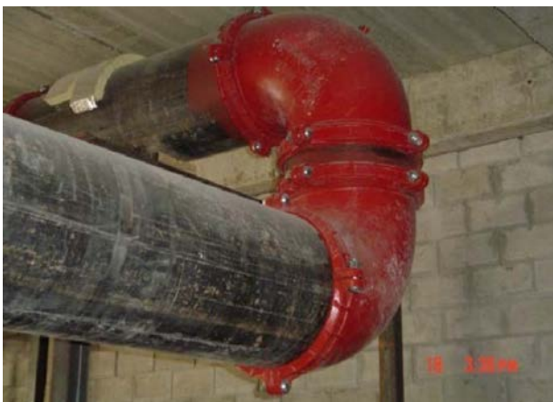
Granada Center- 24" Elbow 90 Degree Model 7110