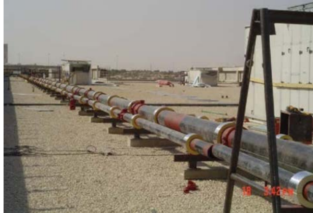
24" Chilled Water Lines