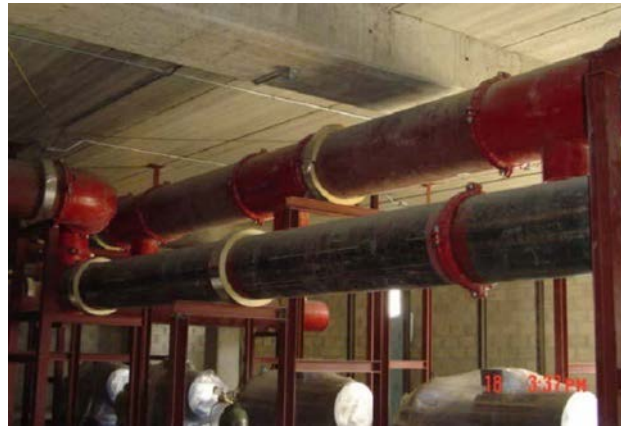
24" Dia Chilled Water Lines- inside Pump Room